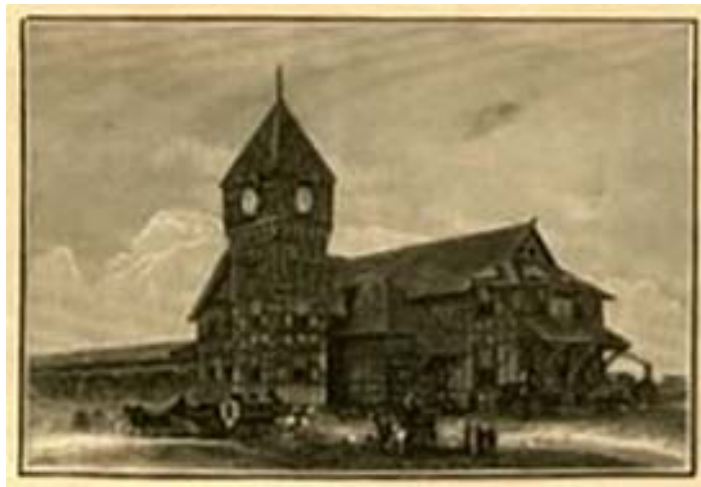
The Norfolk and Western Railroad passenger depot at Norfolk, Virginia, from Virginia, Tennessee and Georgia Air Line's The Scenic Attractions and Summer Resorts along the Railways ... , New York, 1883.