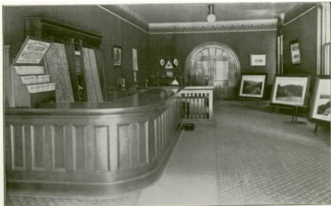
CITY TICKET OFFICE, 324 GAY STREET, KNOXVILLE, TENNESSEE.

We hope that this research guide will prove helpful to students and faculty who are interested in the history and significance of railroads and mass transit.